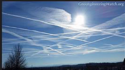
Knoxville, Tennessee.