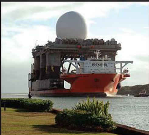
Sea based X-band radio frequency / microwave transmission platform.