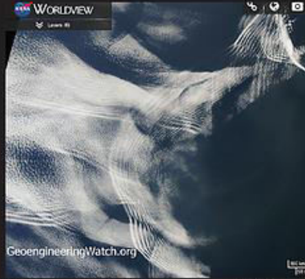
NASA image taken of African west coast (radio frequency / microwave transmission manipulation).