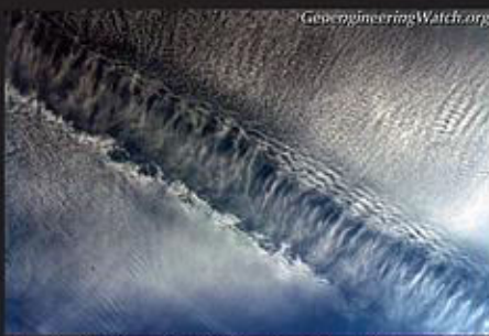
An aircraft dispersion of climate engineering particulates is manipulated with radio frequency / microwave transmissions. Palm Springs, California.