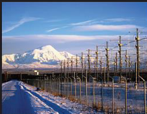
The massively powerful HAARP ionosphere heater transmission facility in Alaska.