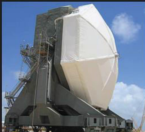
SBX transmission platform interior transmitter.