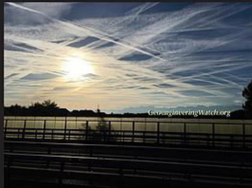
Nyon, Switzerland.

The yellow highlighted statements on the document above are of particular interest. In summary, this US Senate document calls for the complete cooperation with NORMALLY ADVERSARIAL NATIONS due to cross border ramifications from climate engineering. All major powers are colluding, collaborating and cooperating in regard to the ongoing climate engineering crimes and coverup.