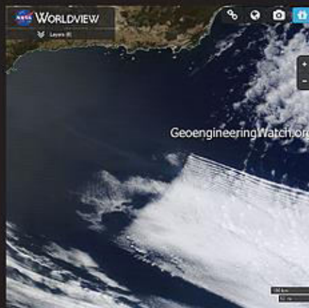
NASA satellite image, radio frequency / microwave transmission manipulated square cloud formation

How unnatural do our skies need to become before populations begin to look up and investigate?