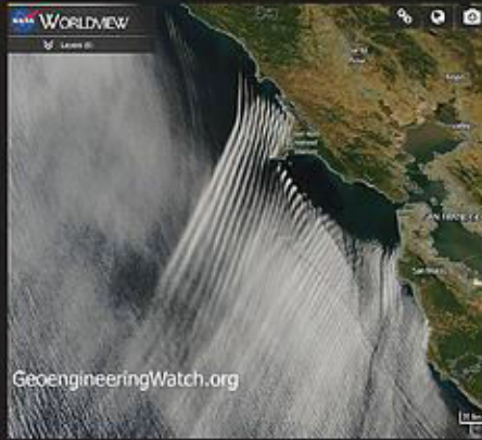
NASA satellite image of the California coastline (radio frequency / microwave transmission manipulation of aerosolized cloud cover / marine layer).