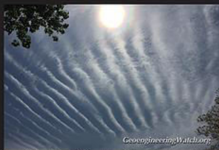
An existing atmospheric saturation of climate engineering particles is manipulated with radio frequency / microwave transmissions. Port Washington, New York.