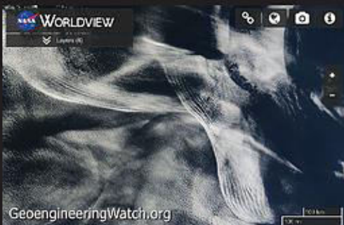
This NASA satellite image taken off the west coast of Africa reveals extensive microwave transmission manipulation.