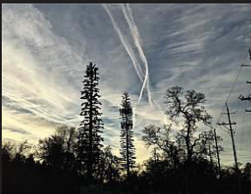
Radio frequency / microwave transmission towers in Redding, California.

Populations are blindly accepting and ignoring the dangerous radio frequency / microwave transmission towers that are increasingly being constructed throughout our country (and the world). If you thought transmission towers were only for cell phone signal repeating, this is not the case.