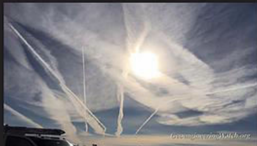
Palmdale, California.