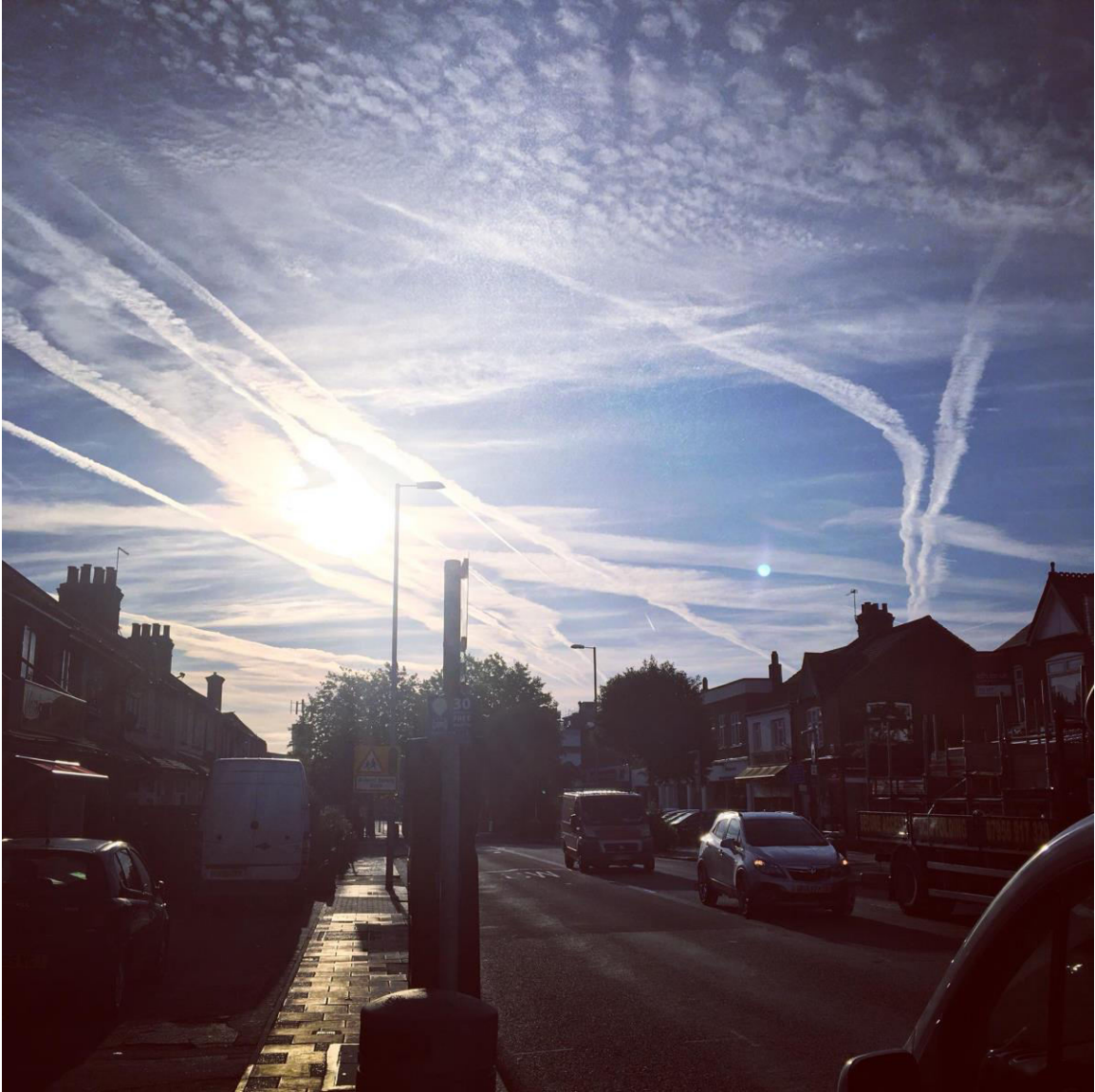
London. Photo credit: Ben Collinge, 2018