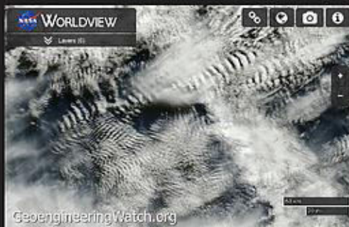
This NASA satellite image clearly reveals many overlapping radio frequency / microwave transmissions in aerosolized cloud formations.

The ongoing atmospheric aerosol spraying and microwave / radio frequency transmissions are wreaking havoc with the Earth's life support systems and human health.