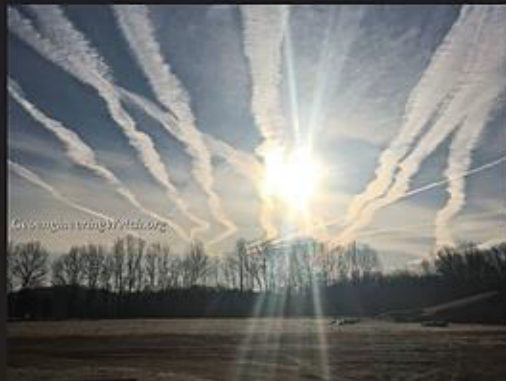
Livingston County, Michigan.